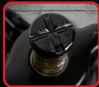
CHROME PLATED RAM

20 TON | 220MM | 429MM CAPACITY | MIN HEIGHT | MAX HEIGHT