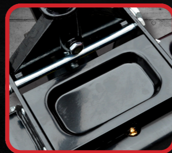
NUTS & BOLTS TRAY

3 TON CAPACITY | 80MM MIN HEIGHT | 500MM MAX HEIGHT