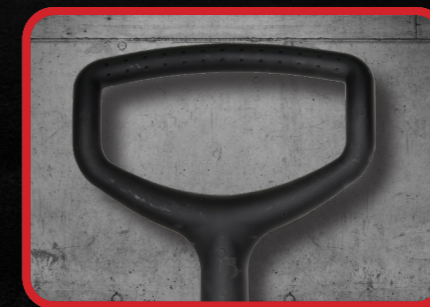
F1 STYLE 'D' HANDLE