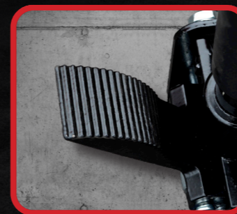
RAPID LIFT PEDAL