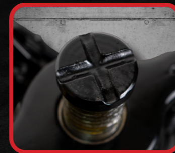
CHROME PLATED RAM