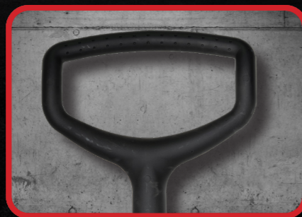
F1 STYLE 'D' HANDLE