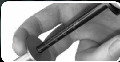
ENGRAVED METRIC SCALE