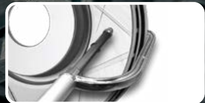
FITS MOST BRAKE DISCS

REMA TIP TOP AUTOMOTIVE UK Limited Westland Square · Leeds · West Yorkshird · S11 5XS Phone: +44 (0)113 277 0044 Fax: +44 (0)113 277 2139 autosales@tip-top.co.uk www.rema-tiptop.co.uk