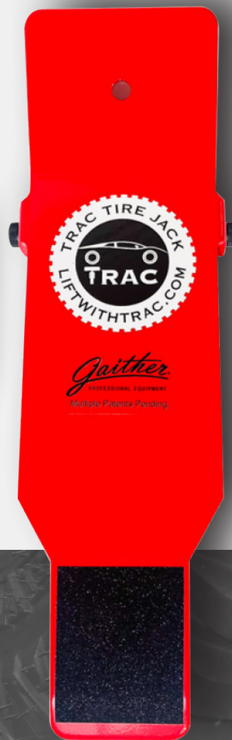
Tyre Rotation Assistance Cart